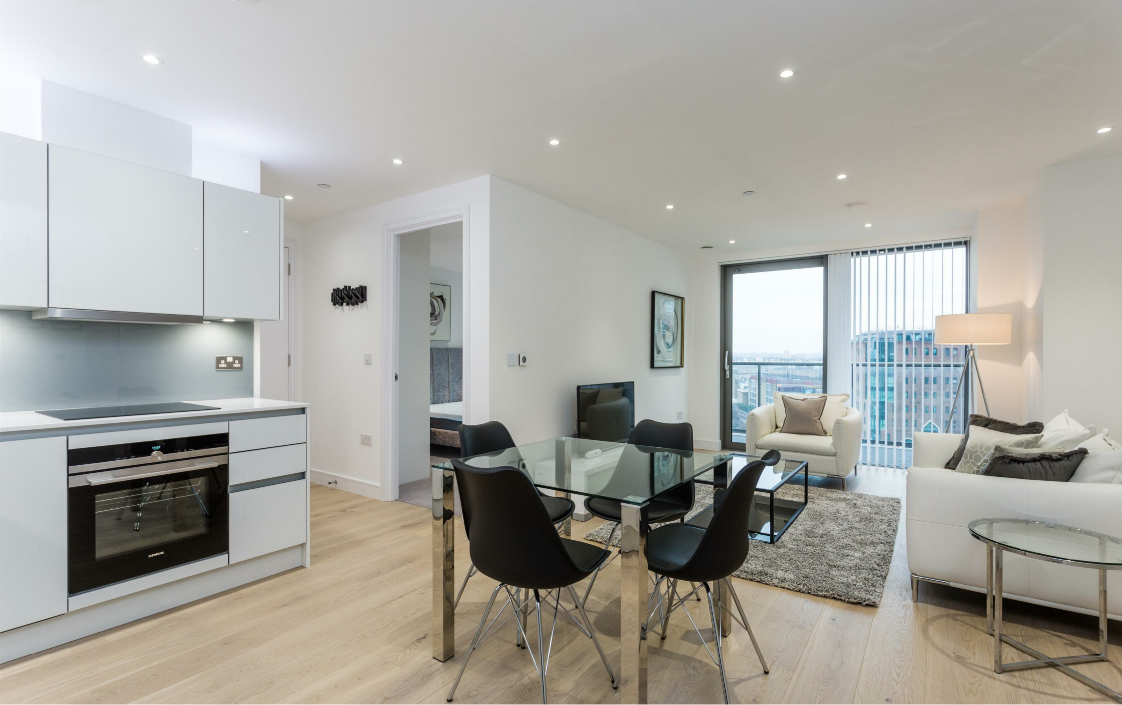
905 Heritage Tower London, E14 3NW £575 Per Week